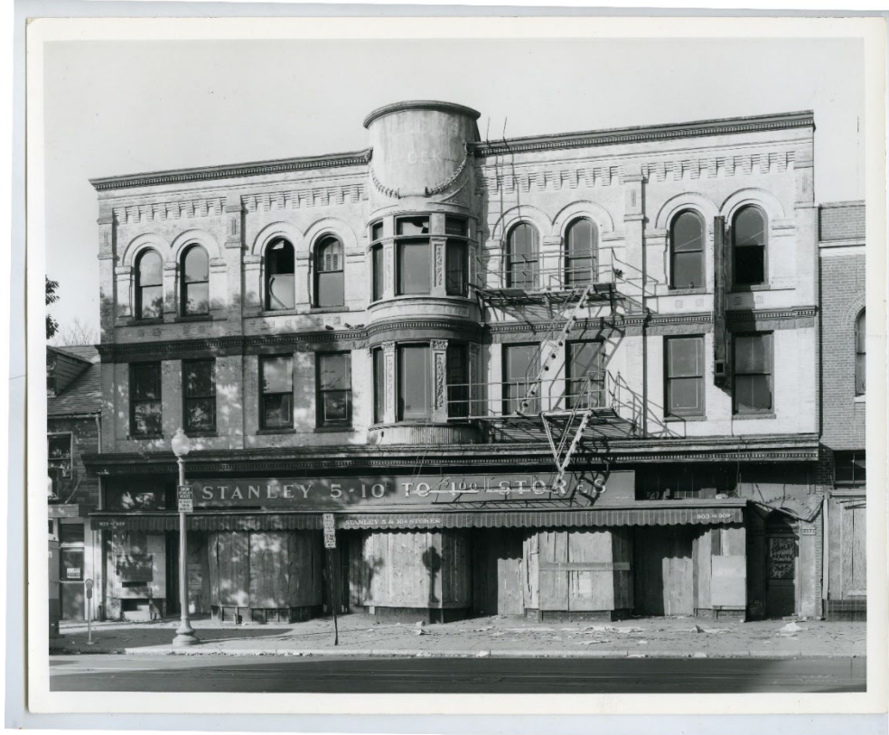
Stanley 5 and 10 cent store, 900 block of 8 th Street, SE (demolished for SE Freeway in 1960s)