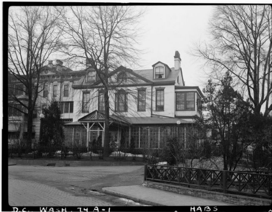
Tingey House (Quarters A), Residence of the Chief of Naval Operations, near 8 th and M sts, SE, Washington Navy Yard, built in 1801, later remodeled. Loc.gov HABS DC,WASH, 74A (1936).