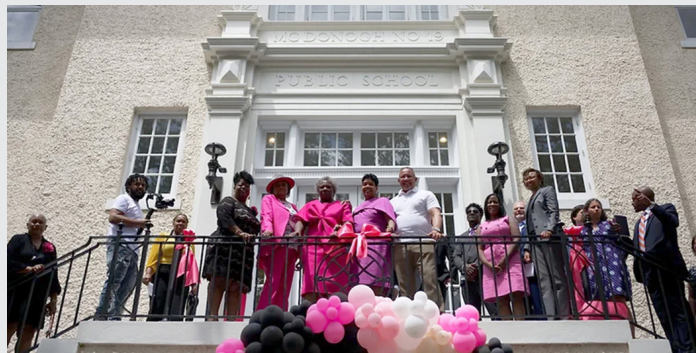
Ribbon Cutting for rehabilitated McDonogh 19, now the TEP Center, May 2022.

The historic McDonogh 19 site reopened as the Tate Etienne & Prevost Center on May 4, 2022, and was renamed for Leona Tate, Gail Etienne and Tessie Prevost, who desegregated the all-white school on November 14, 1960. Escorted to school by U.S. Marshals, this historic event represented a turning point in the Civil Rights Movement following the Brown v. Board of Education court case. In 2016, the building was listed in the National Register of Historic Places as one of the first two schools