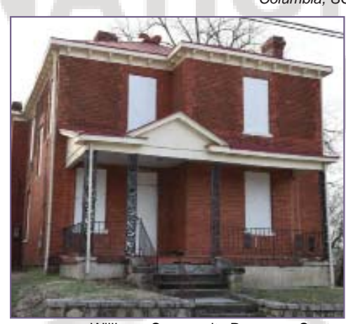
Williams Community Resource Center Danville, VA