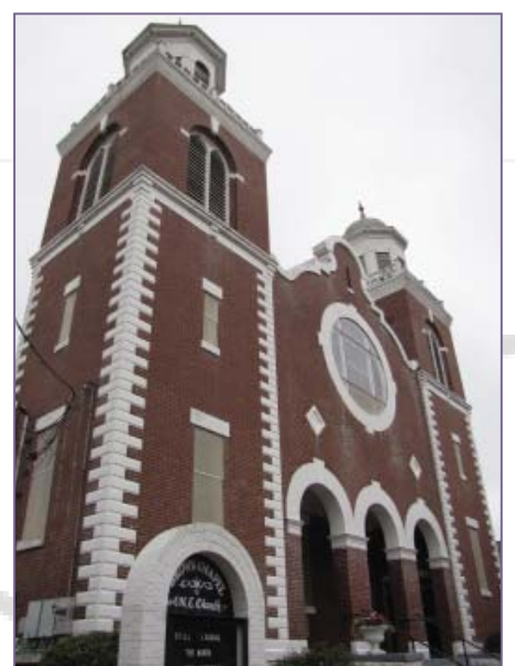
Historic Brown Chapel AME Church Selma, AL

In 2016 and 2017, Congress appropriated funding for a new HPF African American Civil Rights Grant Program. States, Tribes, local governments, and non-profit organizations were eligible to apply for a broad range of planning, preservation, and documentation projects for historic sites associated with the Civil Rights Movement and the African-American experience. The competitive grant program funded 39 projects in 21 states with $8 million in FY 2016 funds. In 2017, the program awarded $13 million for 51 grants in 24 states for history and preservation projects.