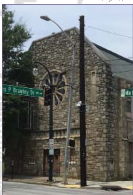
West Hunter Street Baptist Church Atlanta, GA