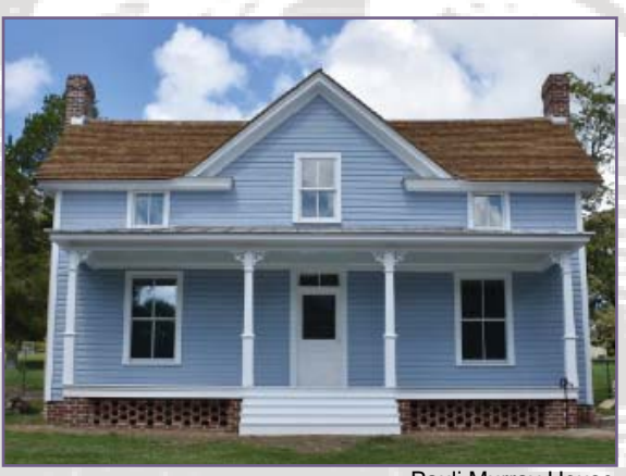
Pauli Murray House Durham, NC