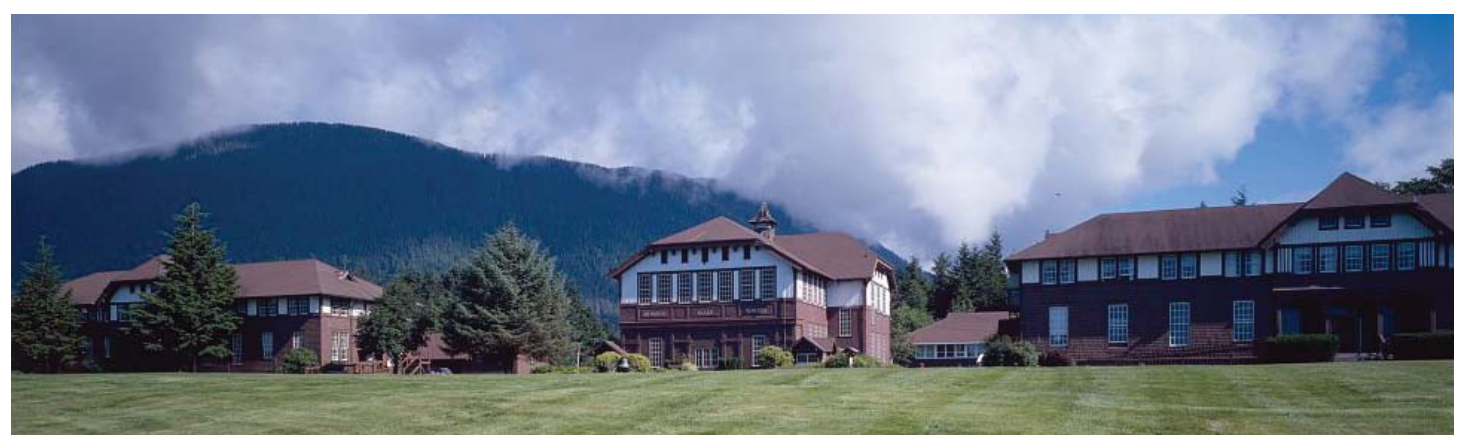
Perspective view across quad from left to right; North Pacific Hall, Allen Auditorium, and Whitmore Hall

In 2017, eleven students worked on rehabilitation of Fraser Hall, including the facade, the south wall, corbels, doors and the porch. The project was funded by a 2016 $24,000 Federal CLG grant with $16,000 in matching funds. When the project was completed, the camp hosted an open house with tours of the building and student presentations about the project. The City of Sitka is also partnered with nonprofits in projects rehabilitating a historic sawmill and a World War II boathouse. These partnerships demonstrate how successful historic preservation can be by providing opportunities for students and residents to be actively involved in local projects.