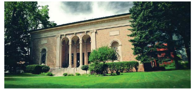
The Blanden Art Museum in Fort Dodge, IA