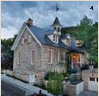
1. 21c Museum Hotel, Lexington, KY; 2. Sheridan Inn, Sheridan, WY; 3. Rainwater Building, Florence, SC; 4. Washington School House, Park City, UT; 5. Erwin House, Bourbon, IN.