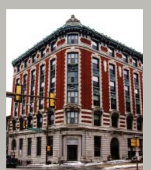
Historic Lafayette Apartments, Butler, PA

The Trinity Place Apartments is a Tudor/Jacobethan-style residential building in Portland, OR, that has remained in use as apartments since its construction in 1910-11. Providing 36 market-rate housing units, Trinity Place Apartments recently underwent a $500,000 certified rehabilitation involving the seismic upgrading of the unreinforced masonry for life/safety.