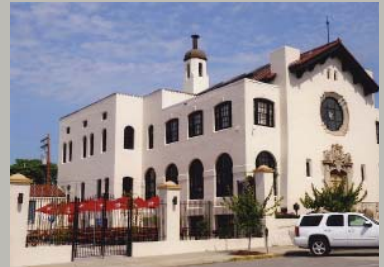
Central States Life Insurance Co. Building, St. Louis, MO

The former Central States Life Insurance Company Building recently became the headquarters of Chameleon Integrated Services (CSI), a St. Louis, MO-based information technology firm, following a $3 million rehabilitation. Individually listed in the National Register, this 1921 Mission Revival-style building was designed for a local corporate headquarters, complete with an impressive two-story atrium. Later used for many purposes, and most recently as a series of nightclubs, CSI purchased the building and returned it to its original use as corporate offices. The building's exterior and surviving historic features on the inside were restored, and state-of-the-art security systems installed. Twenty-seven percent of the work was completed by minority-owned businesses from Greater St. Louis. With their new offices and a building rich in architectural detail, CSI has not only saved an impressive historic resource, but also is contributing to the rebirth of the local community.