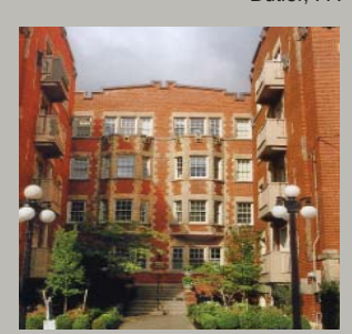
Trinity Place Apartments, Portland, OR